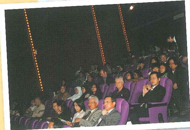
Invited guests who had attended the opening ceremony of the Japanese Film Festival